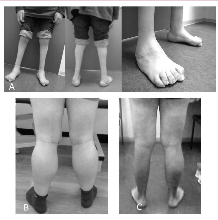
Figure 4 Clinical clues for symptomatic muscle cramps. (A) Atrophy of ventral and posterior lower leg and foot deformities in hereditary motor and sensory neuropathy. (B) Hypertrophy of the calves in Becker muscular dystrophy. (C) Asymmetric atrophy of the left medial calve in limb-girdle muscular dystrophy.

of the American Academy of Neurology published in 2010.^{21}