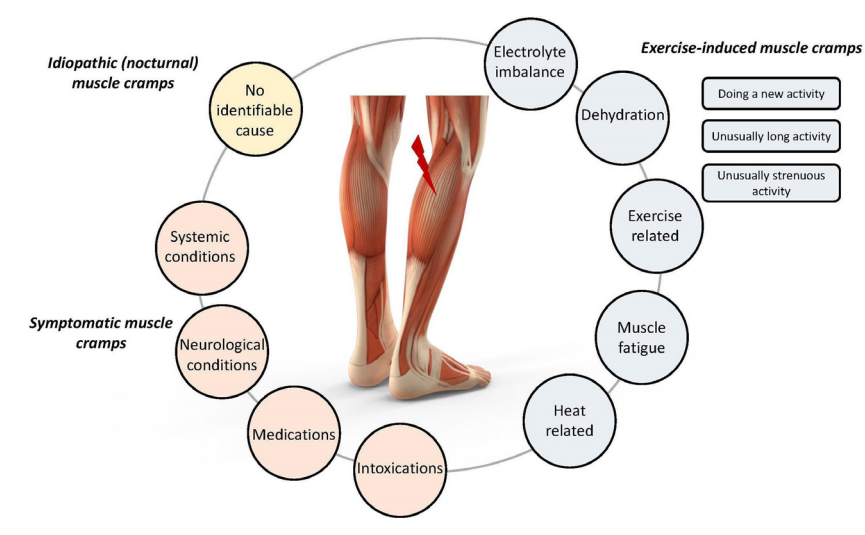
Figure 3 Triggers for developing muscle cramps.

Patients with exercise-induced or idiopathic muscle cramps should be advised that muscle cramps are common and usually harmless, are often due to a combination of factors. Exercise-induced cramps do not in themselves suggest an underlying neuromuscular, neurological or systemic disease. Sometimes reassurance can be sufficient, but some patients may want to seek symptom relief.